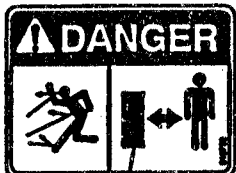
Label Danger Flying